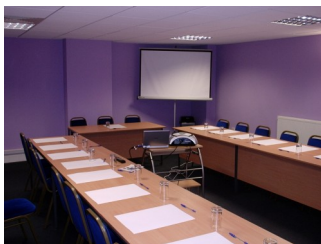
MEETING ROOM 3

40/50 cabaret style 25/30 boardroom style 50/60 theatre style